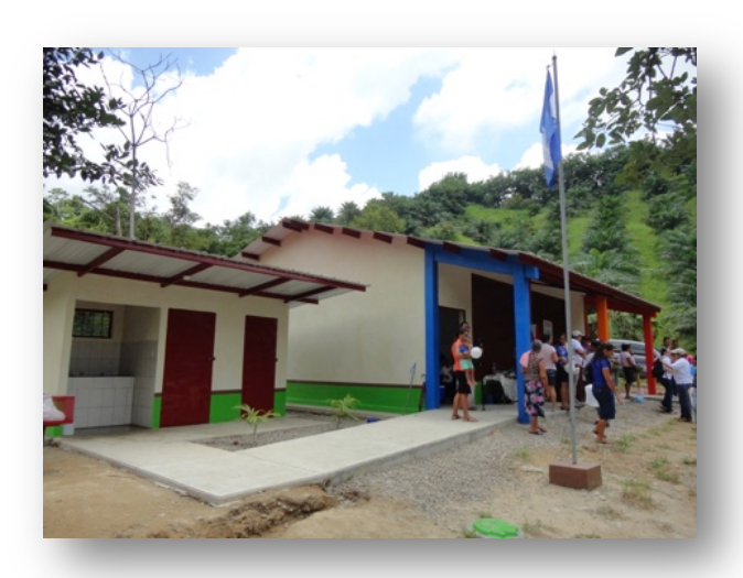
Escuela Jose Trinidad Reyes y Jardin de Ninos Aquistimula Queepi "Matadero School", Honduras